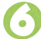
The John Milton Sixth Form