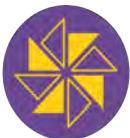
Cedars Park Primary School