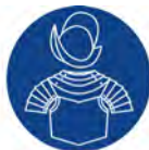
Mendlesham Primary School