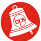
Bacton Primary School